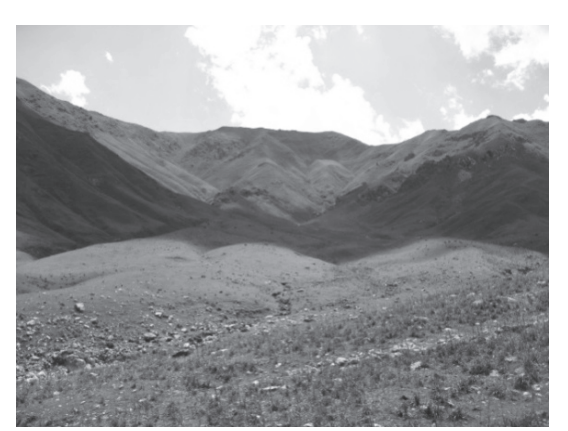
Fig. 2.1: Kara Bulak Pasture's lower and upper parts