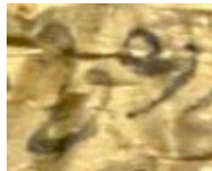
Figure 1.2: Gāndhārī Samgītisūtra commentary, detail of l. ED3

The reflex of OIA [su] is written using the same ligature with the same mystery footmark, as in avbaśp(?)ara- (OIA ābhāsvara- ):