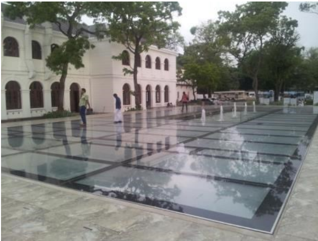
Figure 4: Visitors walk on the fish tank at Arcade