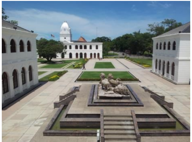
Figure 5: Lion statues are ubiquitous and an exquisite one is found at Arcade