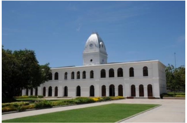
Figure 3: Arcade's former WP Council building with clock tower