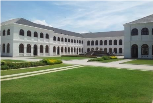
Figure 2: Arcade courtyard: deserted during the day because of the heat