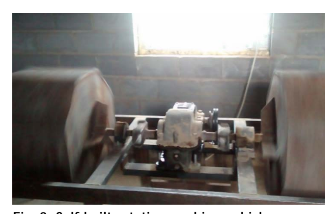
Fig. 2: Self-built rotating machines which are filled with iron balls and stones which over several hours are grinded into sands.

water or in specific, vibrating machines that are lined with grids through which the heavy gold is retained, while sand and dirt is washed away. Finally, the remaining, concentrated gold-dirt mixture is mixed with acid and burned over fires or hotplates, leaving the households with pure gold that is sold in small bottles of penicillin to gold buyers located in Emgekchil for a current price of around 2,200 Som per gram. The gold is then traded at higher prices in Bishkek. However, trade relations further along the production chain was not possible to determine during the field research.