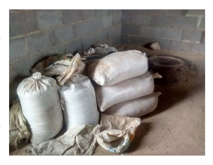
Fig. 1: Bags holding gold-containing stones and sands brought back from the mining sites in Solton-Sary.

some of which motor-operated but mostly consisting of manual tools, which the miners often make themselves. Stones are filled into durable bags that can fit up to 90 kg and carried from the end of the tunnels to the camp-sites where they are finally loaded onto lorries, jeeps and other cars and transported back to the villages (Fig. 1). One bag of stones may contain anything between 0 and 100 g (or even more) of gold, and how much income individual miners make in one trip to the mining sites is starkly fluctuating. The drive to and from the mining site can take a long time and might be dangerous during the winter months, as the dirt roads are often steep and covered in snow.