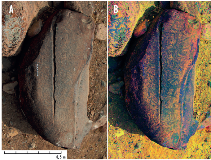
Fig. 3: Highlighting of the contrast on the petroglyph P002 in the cluster Za_01 using the software DStretch – A: photograph conducted in the field; B: photograph processed in DStretch), (photo conducted and processed by A. Augustinová).