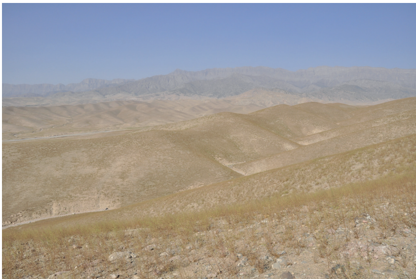
Fig. 1: The landscape in the piedmonts of the Kugitang Mountains (range in the background) – slopes with the petroglyphs in the cluster Za_05, (photo by J. Kysela).