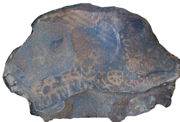
Fig. 2: Orthophotograph of the petroglyph P050 – cluster Za_03 (created by K. Paclíková).