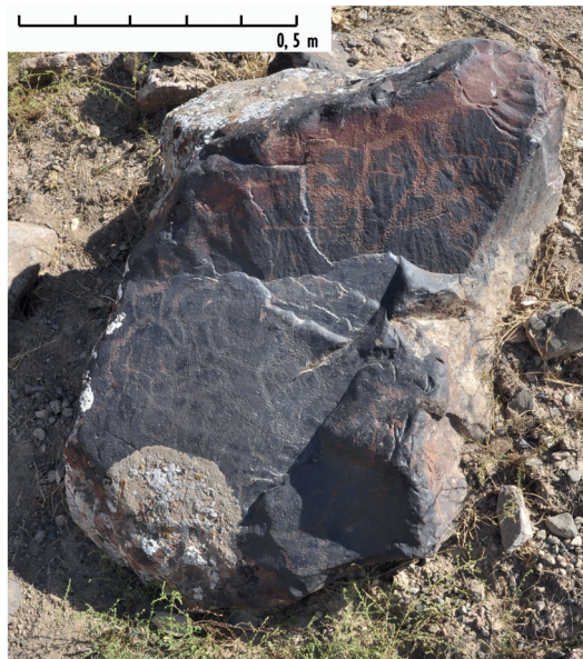
Fig. 4: The petroglyph P111, cluster Za_05.