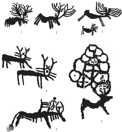
Fig. 3. The image of animals with unusual horns. Bronze Age–Scythian time. 1–3, 6 – Chaylag–Khem, 4 – Shanchig, 5 – Yime.