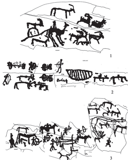
Fig. 4. Chaylag–Khem. Tuva. 1 – the plane with the image of a camel and an arb; 2 – plane with the image of the boat; 3 – the plane with the image of “matchmaking”. Bronze Age.