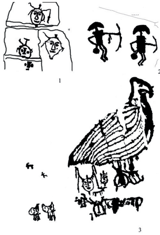
Fig. 1. Petroglyphs of the Bronze Age. 1 – Alydy–Mozag masks; 2 – anthropomorphic figures with the mushroom–shaped heads of Ortaa–Sargol; 3 – the image of a bird, masks and “shamans” Bizhiktig–Khaya.