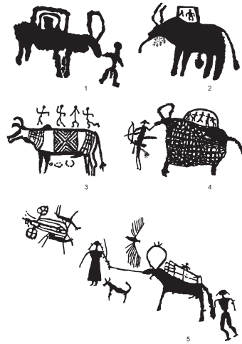
Fig. 2. The image of a pack of bulls. Bronze Age 1 – Sholde–Tey, 2 – Saamchir; 3 – Bhimbetka (India); 4, 5 – Baga–Oygur (Mongolian Altai).