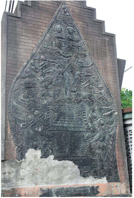
6. The Gunungan monument from Yogyakarta, July 2014.