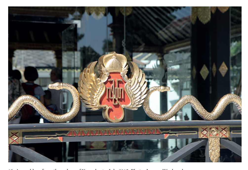
13. An emblem from the palace of Yogyakarta, July 2015.