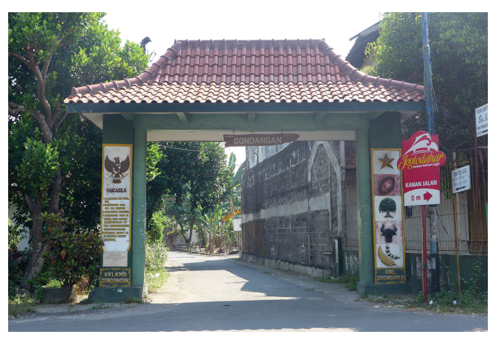
10. A "Pancasila Gate" with a joglo-like roof, June 2014.