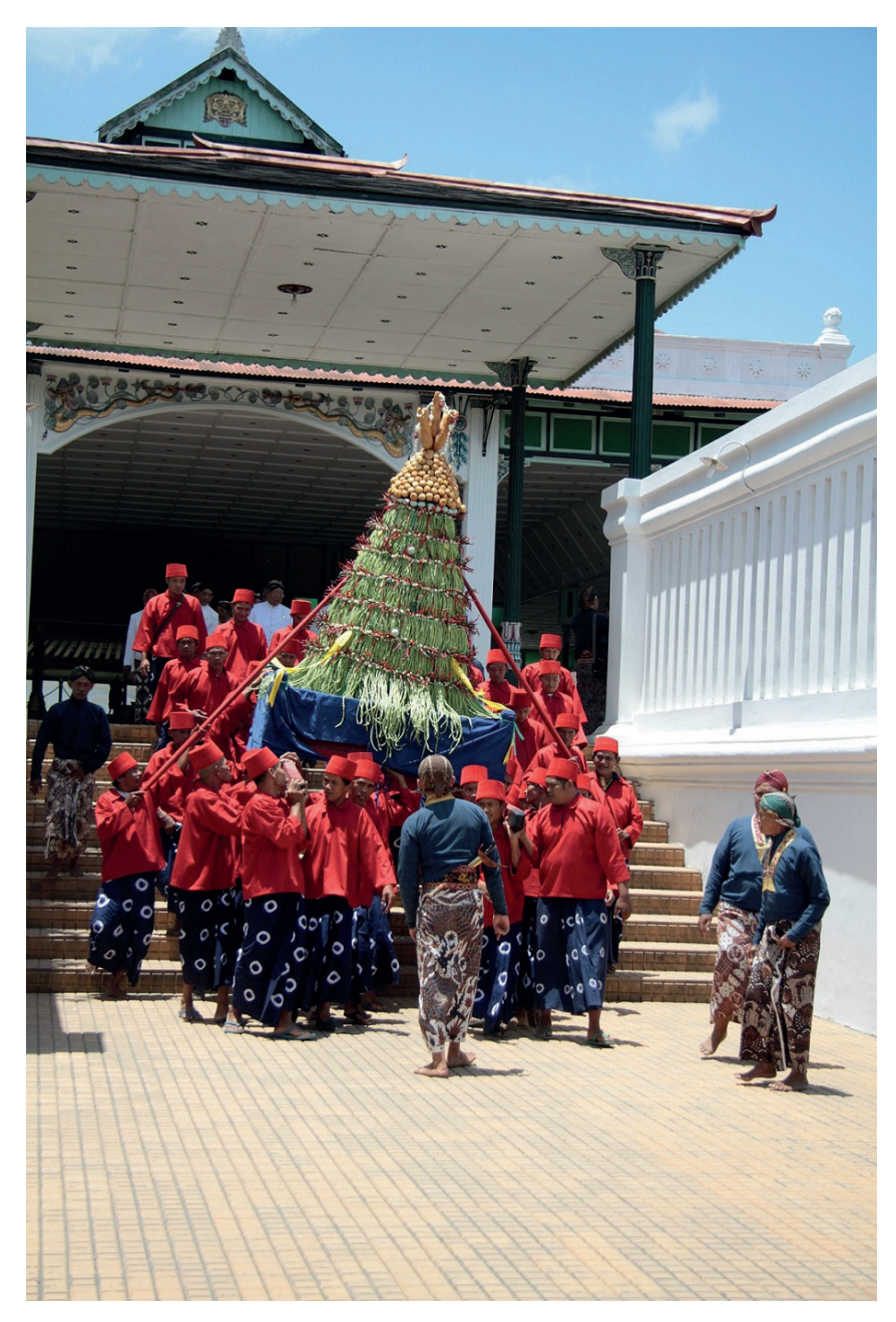
11. A Tumpeng from the palace of Yogyakarta, 15 October 2013.