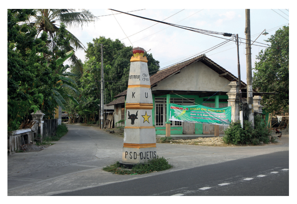
2. A monument from kecamatan Jetis, July 2015.