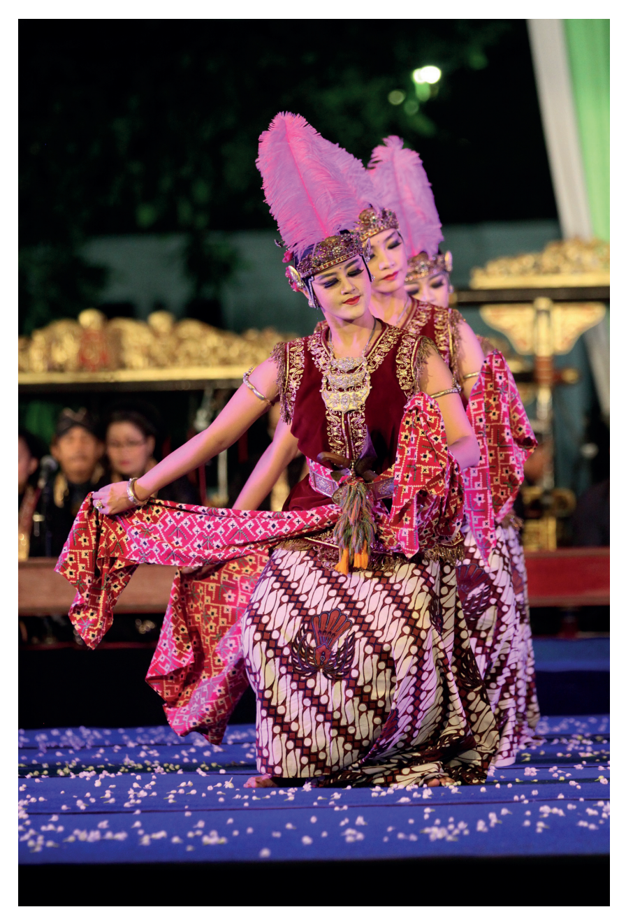
12. A dance in the Sultan's Palace, 18 May 2015.