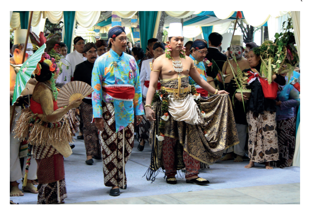
9. A royal wedding in the palace of Yogyakarta, 22 October 2013.