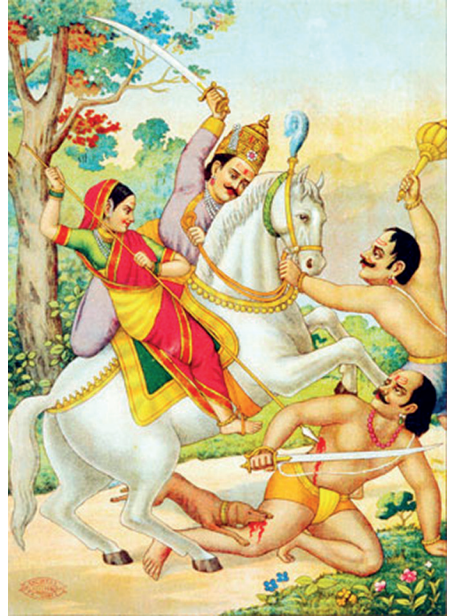
5. Khandoba and Mhalsa killing demons Mani-Malla. Ravi Varma Press. Lithograph by Chitrashala Press, circa 1880, Lithograph.