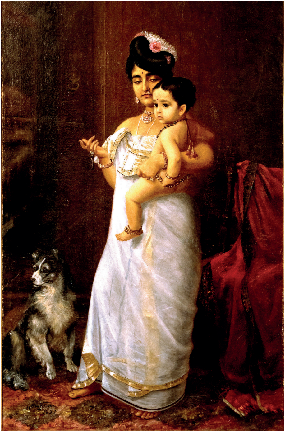
17. Raja Ravi Varma, There Comes Papa, 1893, Kowdiar Palace, Thiruvananthapuram.