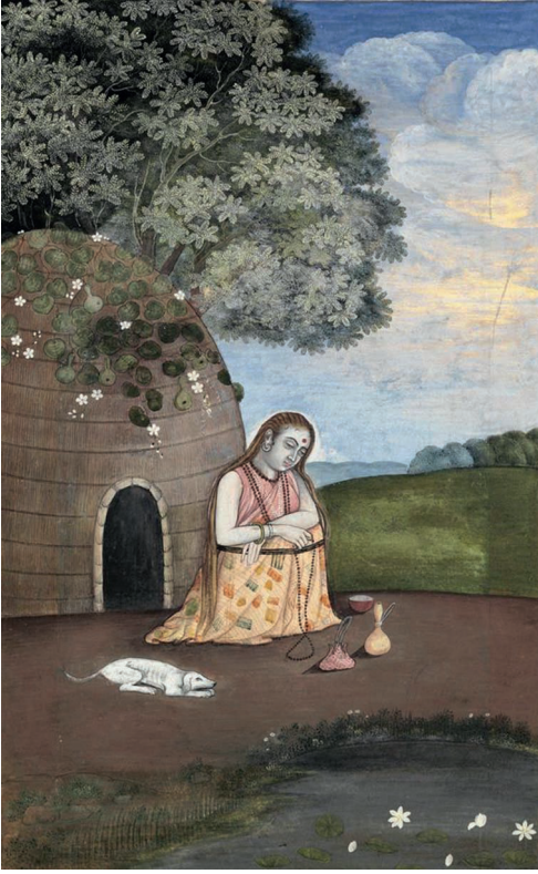
11. Yogini in Meditation, Murshidabad, c. 1760, Private collection.