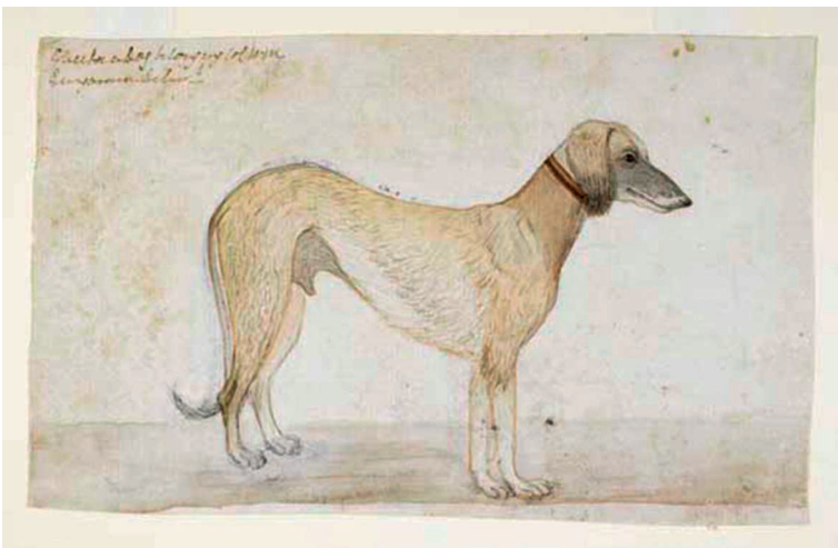
Fig. 16. A light brown saluki, By Gangaram, 1790. Inscribed above: Chuba a Dog belonging to CWM. Gangaram delint., British Library, Add.Or. 4146.