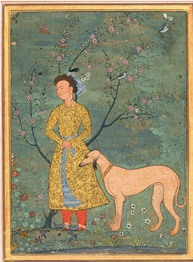
10. A portrait of a nobleman with a dog, attributable to a follower of Farrukh Beg, possibly Muhammad Ali, Mughal, early 17th century, Private collection.