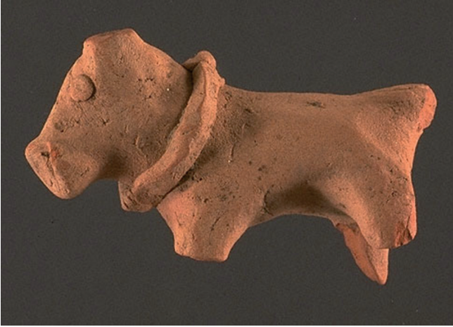
1. Dog, The Indus Valley Civilisation, ca. 2500 BC, https://www.harappa.com/blog/dogs-ancient-indus-valley