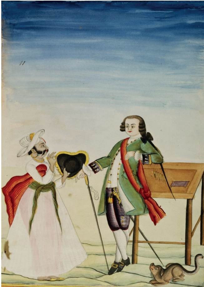
14. A French officer handing his manservant his hat, Madras, ca. 1785, Victoria&Albert Museum, London, IS.75:11-1954.