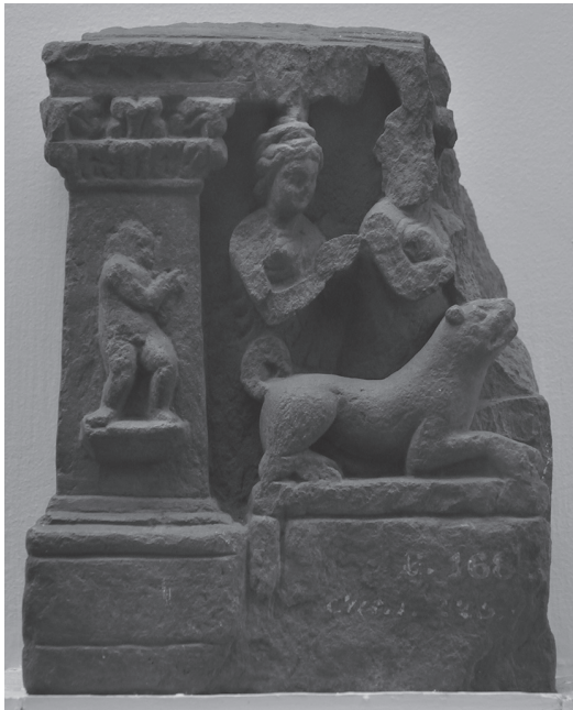
6. White Dog Barking at Buddha, Jamalgarhi, Gandhara, 2nd century CE, Indian Museum, Kolkata, Photo Biswarup Ganguly.