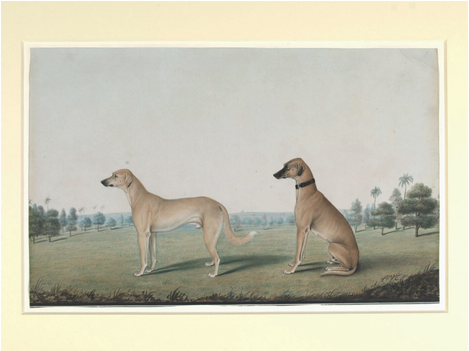
Fig. 15. Two dogs in the compound of a Calcutta house, Calcutta, ca. 1845, Victoria&Albert Museum, London, IS.6-1957.