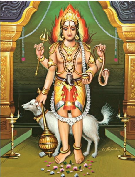
2. Bhairava, Popular print, 20th century.