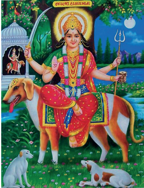
4. Hadkai Mata, Popular print, 20th century.