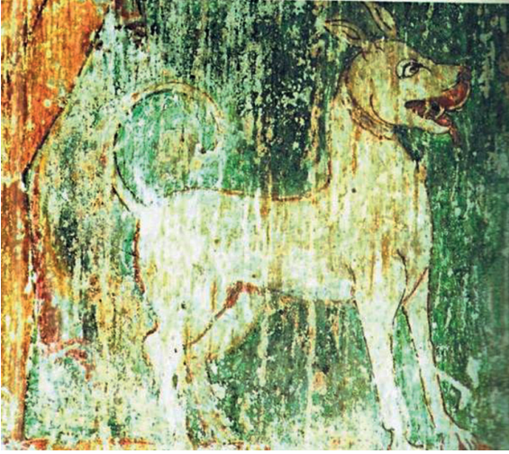
7. Alangu, Rajarajeswaram temple in Thanjavur, 1003 and 1010 AD., https://www.thehindu.com/news/national/tamil-nadu/chola-mural-tells-a-tale-of-dog/article6498185.ece