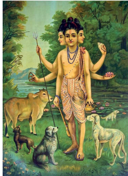
3. Raja Ravi Varma, Dattatreya, circa 1910, Printed at Ravi Varma Press, Malavli near Lonavala, Maharashtra.