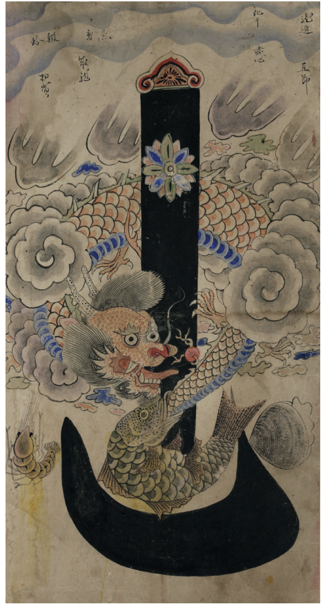
12. Panel of munjado folding screen with the character chung (loyalty).