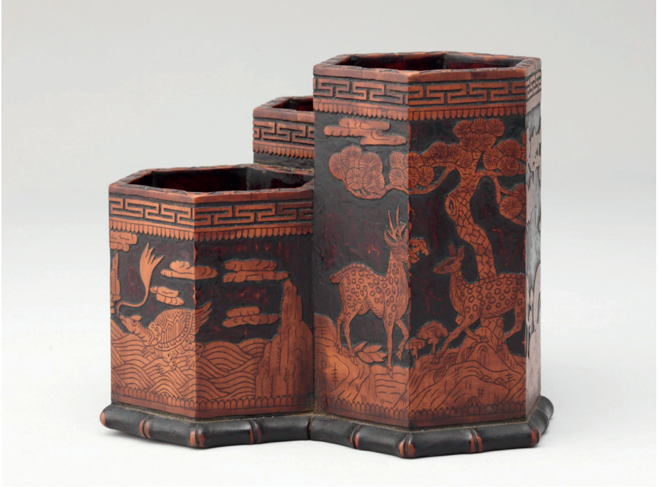
16. Sarangbang pencil case.