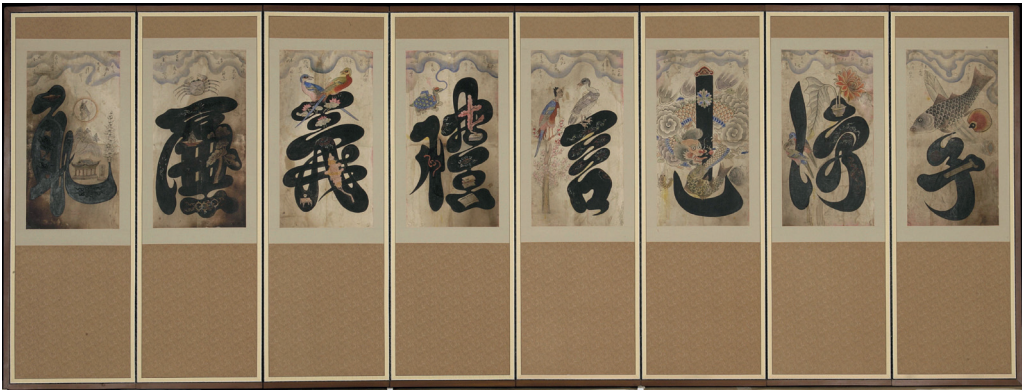
5. Munjado folding screen.