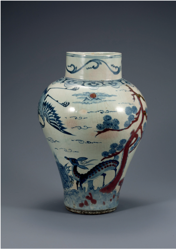
4. 19th-century porcelain jar painted in underglaze cobalt and copper.