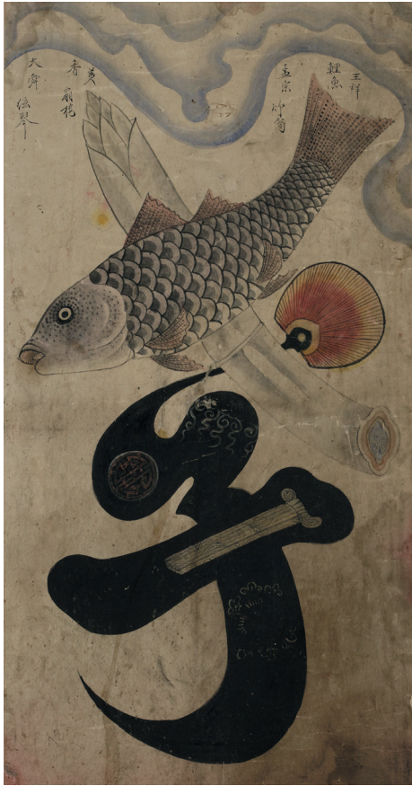
11. Panel of munjado folding screen with the character hyo (filial piety).