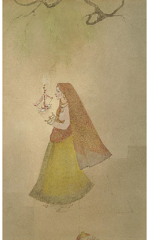
4. At the Ganges, Abanindranath Tagore, 1921, private collection