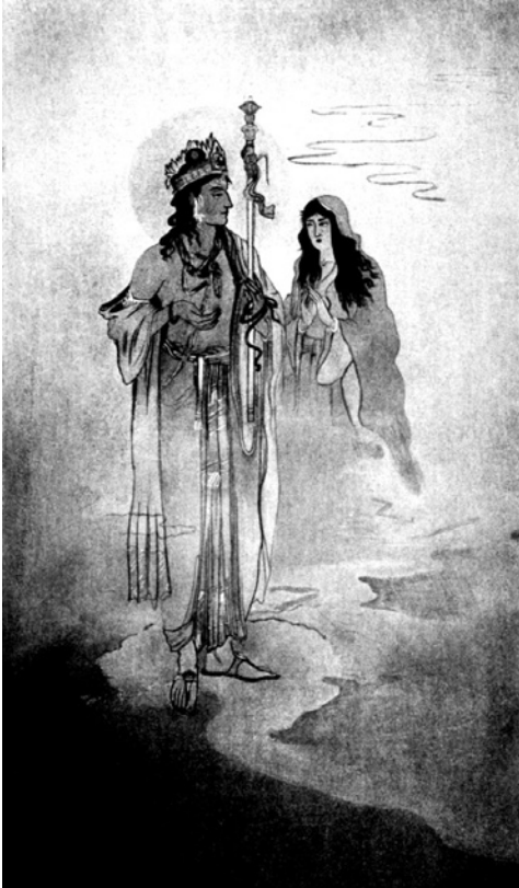
3. Savitri and Yama, Nandalal Bose, 1913, Donald Alexander Mackenzie, Indian Myth and Legend, Gresham, London, 1913, 52-53