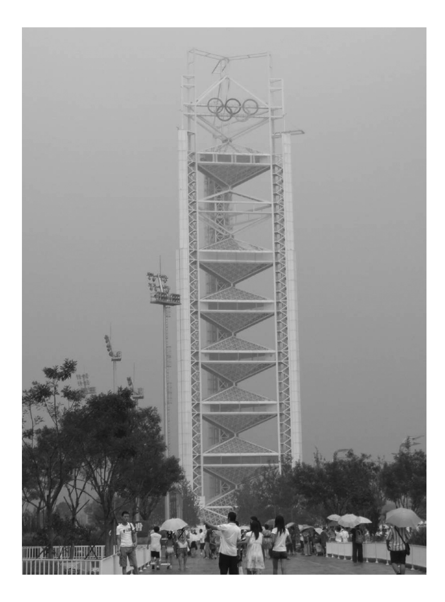
Fig. 3. Cui Kai (CAG Design Studio), Broadcast tower in Olympic village, Beijing 2007, (photo J. Kucharzewska 2009)