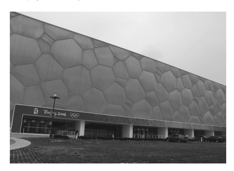
Fig. 5. PTW Architects (Australia), CSCEC International Design (Chiny), ARUP, National Swimming Center – the Water Cube, Beijing 2003–2008