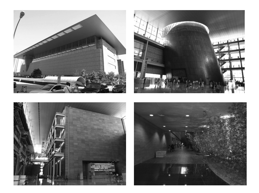
Fig. 2. Cui Kai (CAG Design Studio), Jean-Marie Duthilleul and Etienne Tricaud (studio AREP), Capital Museum, Beijing (Chaoyang District) 2006, (photo J. Kucharzewska, 2009). A-outside view; B-Oval Exhibition Hall, C-Rectangular Exhibition Hall; D – basement story