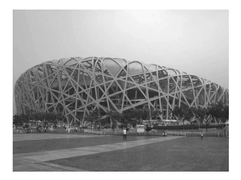
Fig. 4. Herzog & de Meuron, Ai Wei Wei, ARUP, National Stadium – the Bird's Nest, Beijing 2003–2008