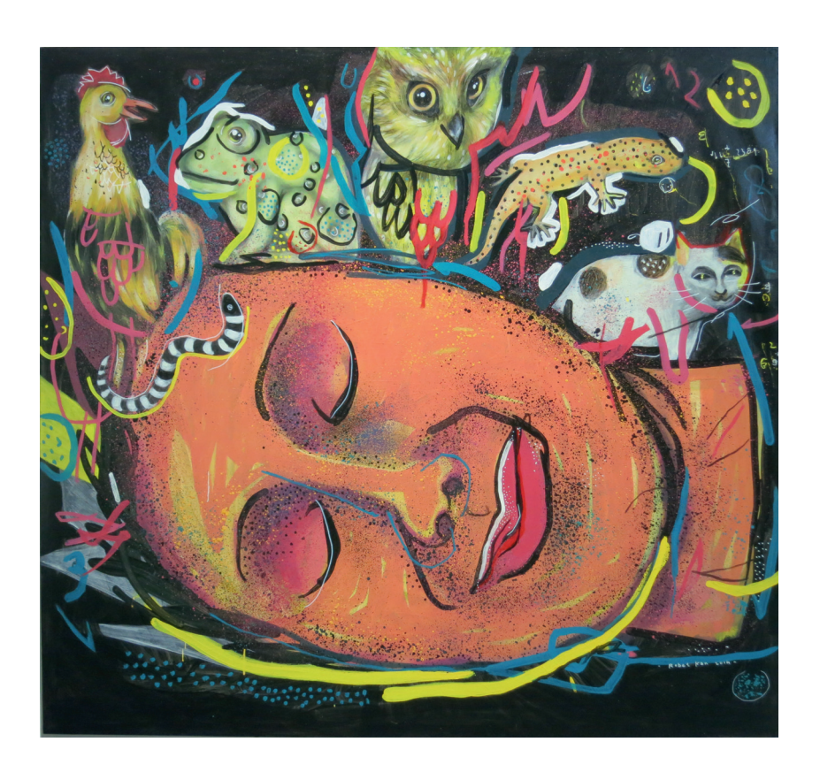
Fig. 5. Robet Kan. Melihat Dengan Pendengaran. 140 x 150 cm Acrylic on Canvas. 2014, photo M. Lis