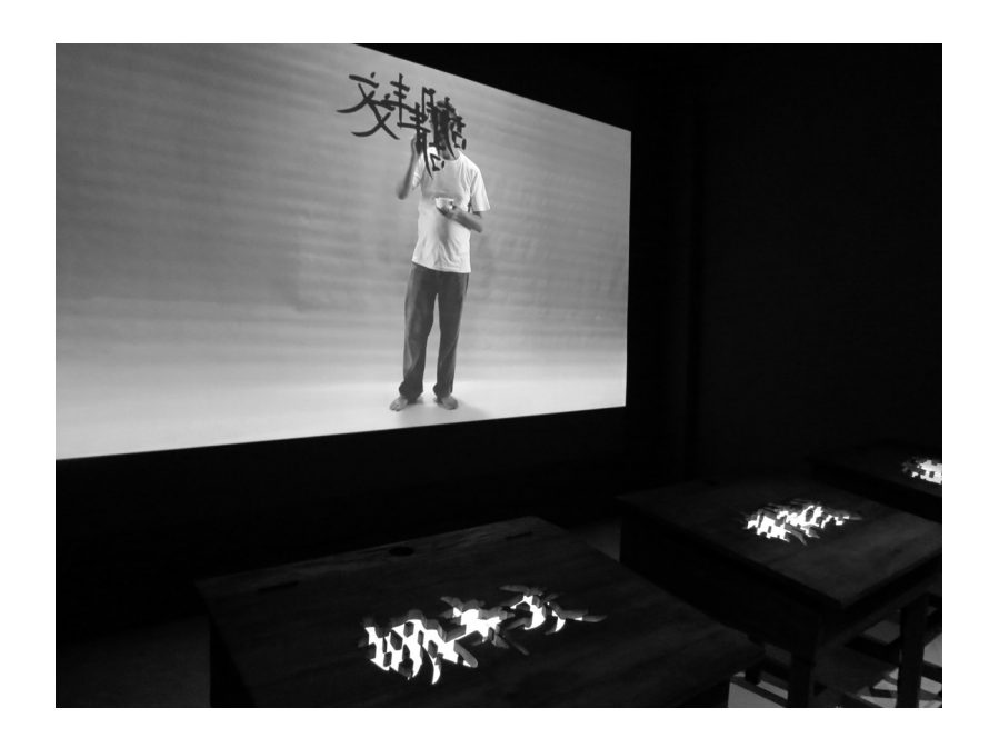
Fig. 1. FX. Harsono. Writing in the rain. Installation. 2011