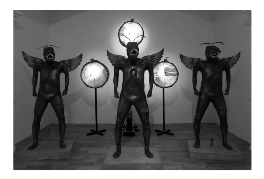
Fig. 2. Nasirun. Bajaj Pasti Berlalu. Silver&Gold. 2009–2010