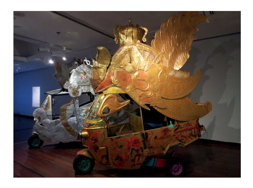
Fig. 3. Heri Dono. The Three Donoraurus. Installation. 2013