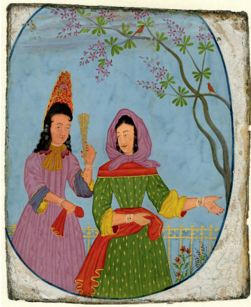
Fig. 1. Two European ladies in French clothing, Udaipur Style, c. 1720, © Trustees of the British Museum (1956,0714,0.26)