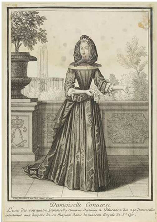
Fig. 2. Damoiselle Converse, Henri Bonnard II, (1637–1711), © Victoria and Albert Museum, London (E.21379–1957)