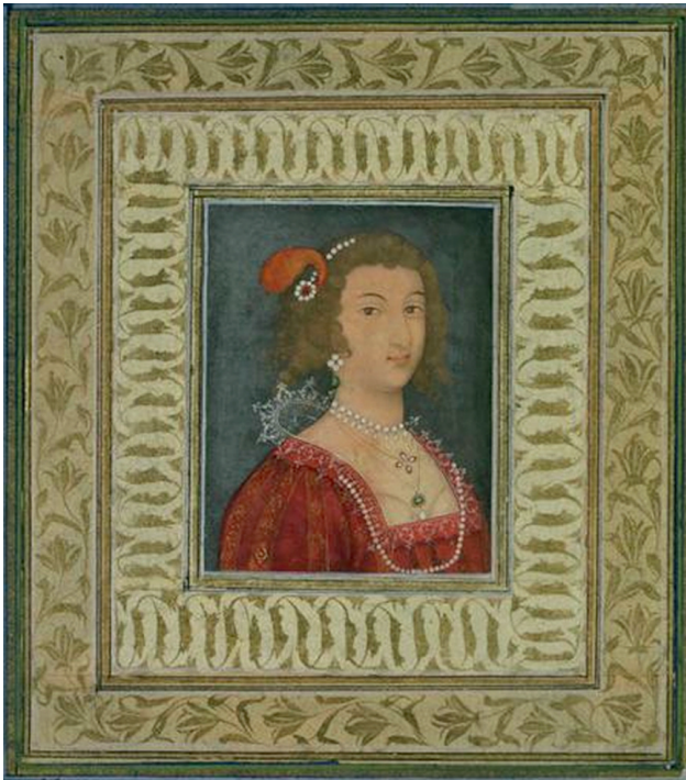
Fig. 4. Lady Shirley, Mughal School, c. 1650 © Victoria and Albert Museum, London (IM.8-1913)