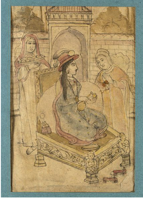
Fig. 13. Lady with two attendants, Rajasthan, late 18 th century © Victoria and Albert Museum, London (IS.461–1952)