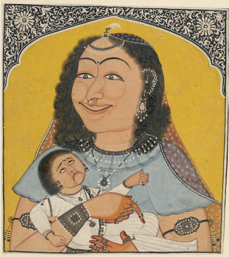
Fig. 19. A bust portrait of a mother and child. Rajasthan School 18 th century (early) (1949,1008,0.23)