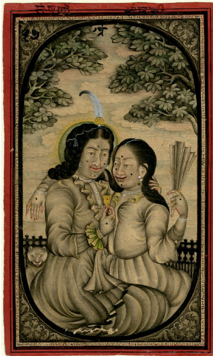
Fig. 10. Two lovers in European clothing seated on a terrace Udaipur Style, c. 1720, © Trustees of the British Museum (1956,0714,0.27)