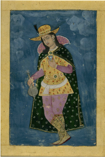
Fig. 11. Portrait of a woman, Rajasthan School, 18 th century, © Trustees of the British Museum (1920,0917,0.13.7)