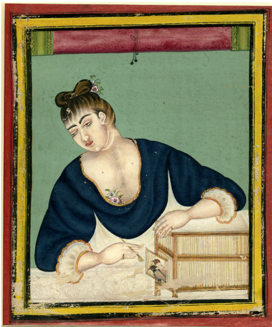
Fig. 8. A woman in European clothing feeding pet birds in a cage, Udaipur Style, c. 1720, © Trustees of the British Museum (1956,0714,0.28)