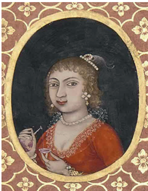
Fig. 6. Portrait of the lady, Mughal School, late 18 th century, private collection