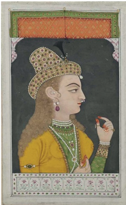
Fig. 12. Portrait of a woman, Mughal School, c. 1740, private collection