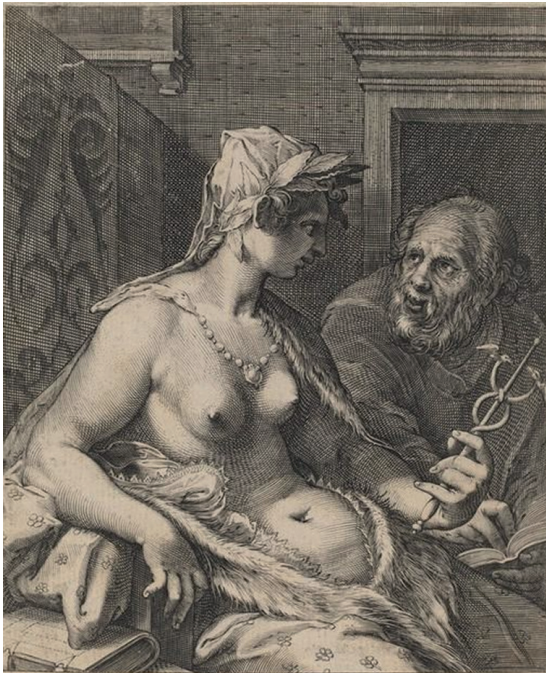
Fig. 14. Poetry from The Liberal Arts , Engraving by Cornelius Jacobsz Drebbel (1572–1634), after Hendrik Goltzius, Museum of Fine Arts, Boston