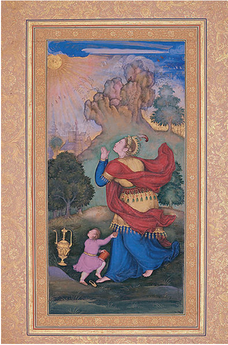
Fig. 7. Woman Worshipping the Sun: Page from the Gulshan Album, attributed to Basawan (active ca. 1556–1600), c. 1590–95, Mughal court at Lahore or Delhi, Museum of Islamic Art, Doha, www.metmuseum.org