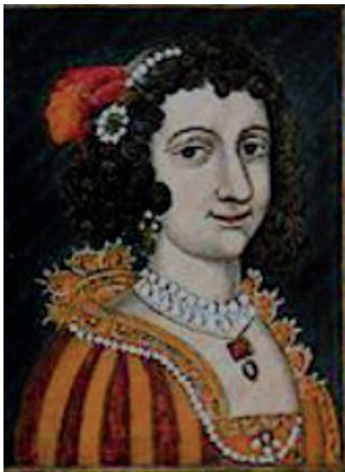
Fig. 5. Portuguese lady, Mughal School, 17 th century, Bibliotheque Nationale Paris (fol. V. 6200)