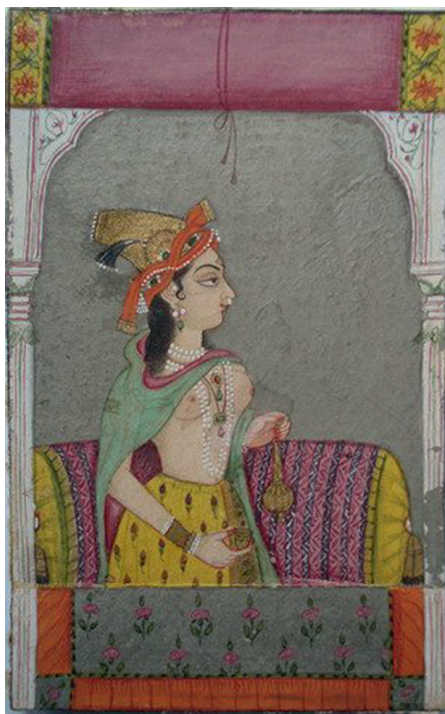
Fig. 18. Courtesan with cup and flask, 1770, Bikaner, private collection