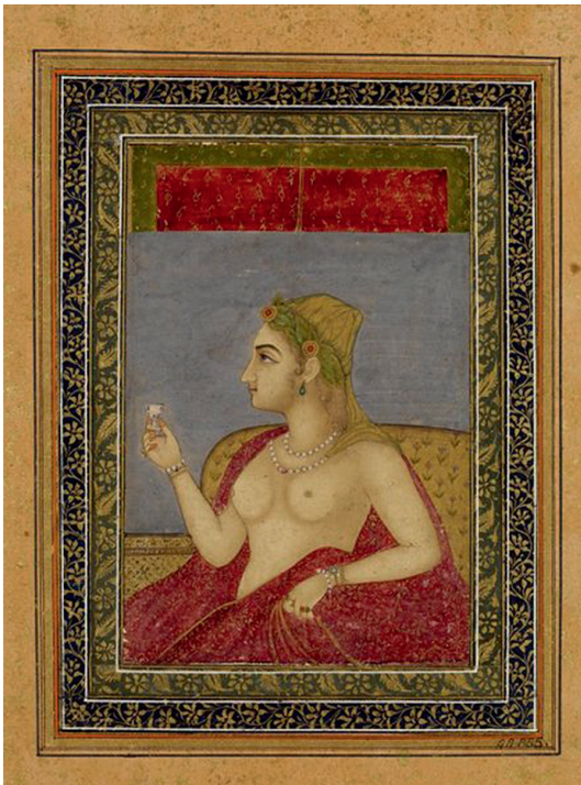
Fig. 16. Portrait of a woman. Mughal School, c. 1700, © Victoria and Albert Museum, London (IS.259–1952)