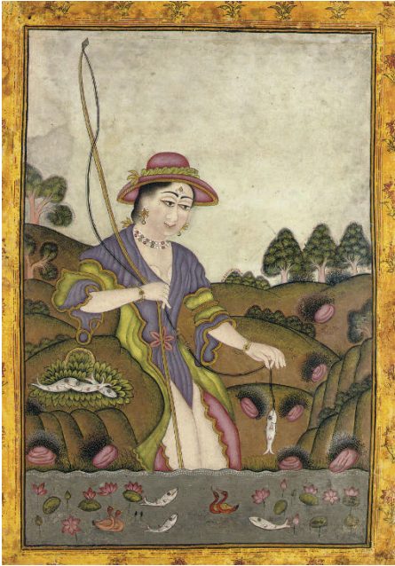
Fig. 9. A European lady fishing, Uniara, c.1760, private collection