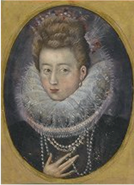
Fig. 3. Oval bust portrait of European woman in 17 th -century dress (fragment), Mughal School, The Bodleian Library, University of Oxford (MS. Ouseley Add. 171)