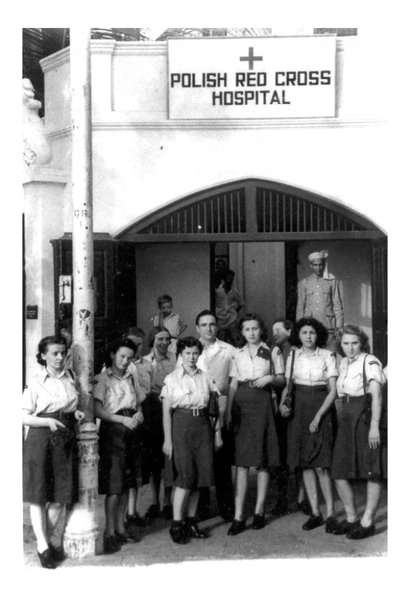
Fig. 4. Polish Red Cross Hospital in Bombay in 1943.