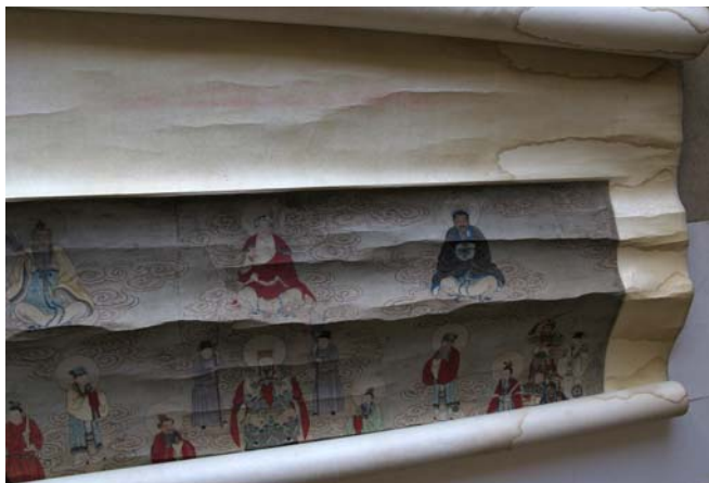
Ill. 1. "Buddhist-Taoist and Confucian Pantheon", 19th c., Asia and Pacific Museum in Warsaw, inv. no: MAiP 4399. Condition before the conservation treatment. The scroll being unrolled on the table, showing horizontal deformations and staining