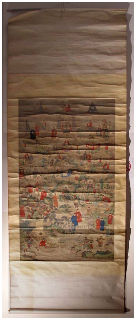
Ill. 6. “Buddhist – Taoist and Confucian Pantheon”, 19th c., Asia and Pacific Museum in Warsaw, inv. no: MAiP 4399. Condition before the conservation treatment