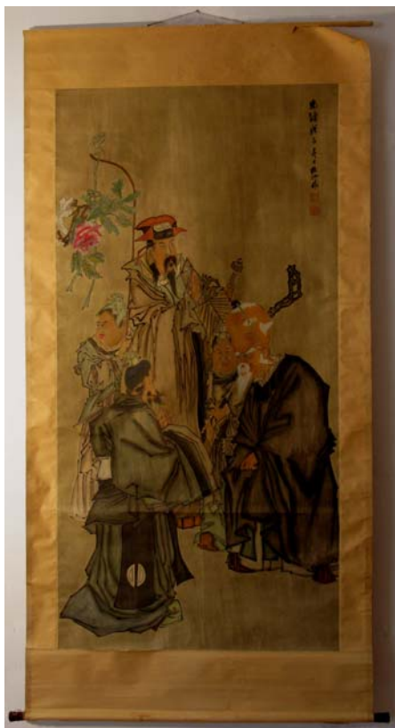
Ill. 2. "Three Gods of Good Fortune", 19th c., Asia and Pacific Museum in Warsaw, inv. no: MAiP 15814. Condition before the conservation treatment. The scroll in the ranking light