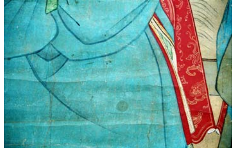
Ill. 19. "The Portraits of the Ancestors", 19th/20th c., private collection in Warsaw. The detail showing the poor condition of azurite and relatively good condition of cinnabar/vermillion parts