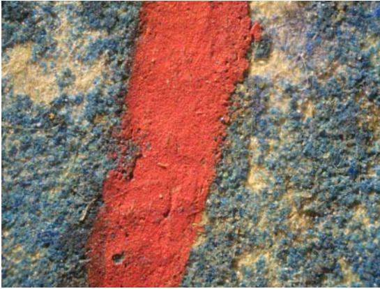
Ill. 12. "Landscape with architecture", 19th c., Asia and Pacific Museum in Warsaw, inv. no: MAiP 5394. Microscopic magnification of the layers of azurite and cinnabar/vermillion