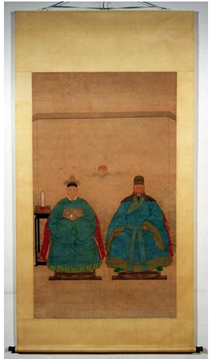
Ill. 9. "The Portraits of the Ancestors", 19th/20th c., private collection in Warsaw. Condition after the conservation treatment