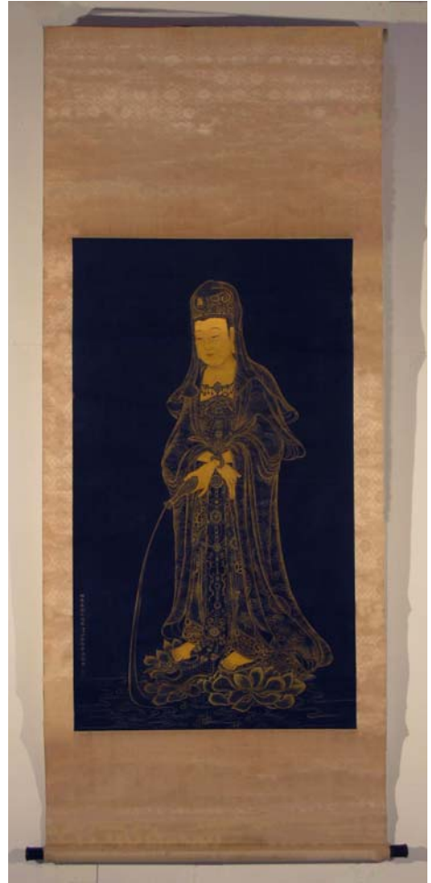
Ill. 5. "Bodhisattva of Compassion", 19th c., Asia and Pacific Museum in Warsaw, inv. no: MAiP 15814. Condition after the conservation treatment