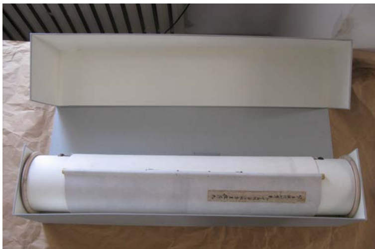
Ill. 22. Such constructions have been made for Chinese scrolls in Asia and Pacific Museum and the scrolls have preserved in good condition.