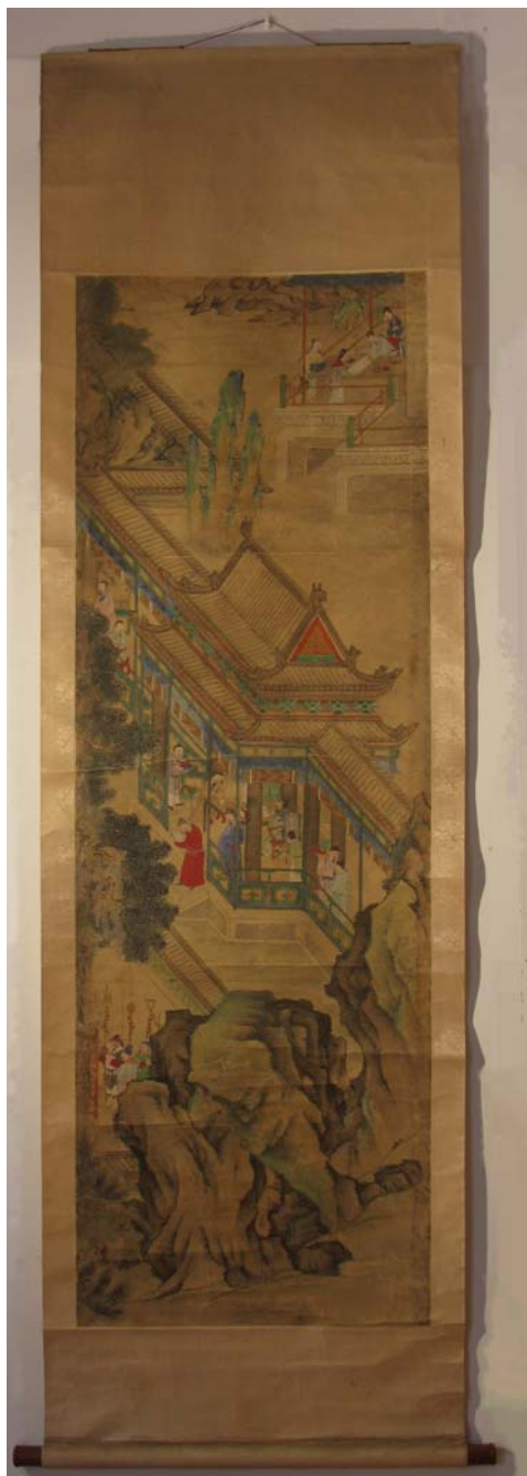
Ill. 10. "Landscape with architecture", 19th c., Asia and Pacific Museum in Warsaw, inv. no: MAiP 5394. Condition before the conservation treatment