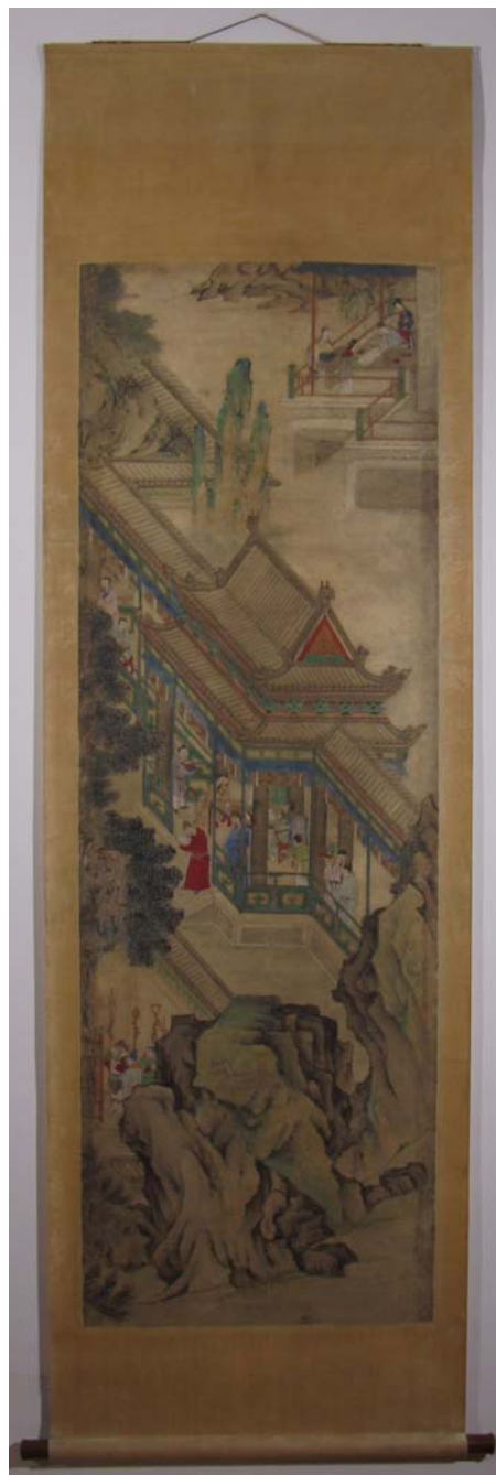
Ill. 11. "Landscape with architecture", 19th c., Asia and Pacific Museum in Warsaw, inv. no: MAiP 5394. Condition after the conservation treatment