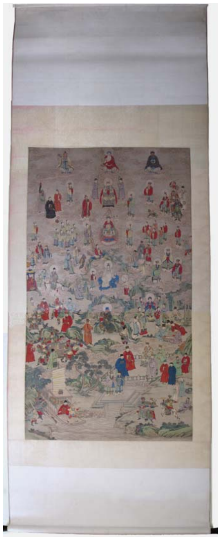
Ill. 7. “Buddhist – Taoist and Confucian Pantheon”, 19th c., Asia and Pacific Museum in Warsaw, inv. no: MAiP 4399. Condition after the conservation treatment