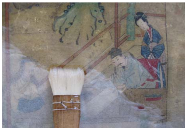
Ill. 17. "Landscape with architecture", 19th c., Asia and Pacific Museum in Warsaw, inv. no: MAiP 5394. The detail of the painting, shown on the ill. 15, during the procedure of facing in course of the conservation treatment