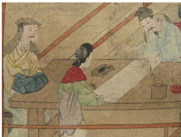
Ill. 15. "Landscape with architecture", 19th c., Asia and Pacific Museum in Warsaw, inv. no: MAiP 5394. The detail with painting layers of the red cinnabar/vermillion, blue azurite and green malachite, showing the good condition of red colours compared with others