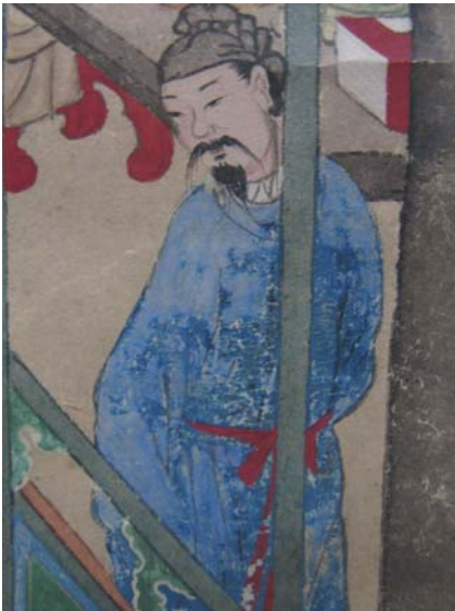
Ill. 13. "Landscape with architecture", 19th c., Asia and Pacific Museum in Warsaw, inv. no: MAiP 5394. A detail of the painting with parts of historic retouching within the blue areas