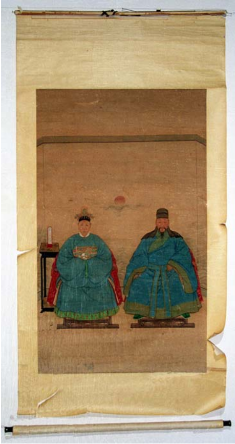
Ill. 8. "The Portraits of the Ancestors", 19th/20th c., private collection in Warsaw. Condition before the conservation treatment