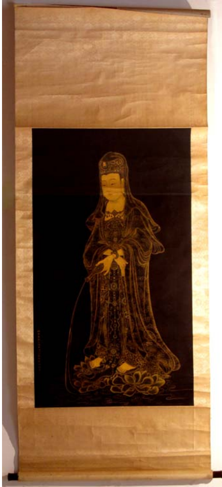
Ill. 4. "Bodhisattva of Compassion", 19th c., Asia and Pacific Museum in Warsaw, inv. no: MAiP 15814. Condition before the conservation treatment. The scroll in the ranking light