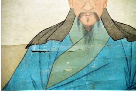
Ill. 18. "The Portraits of the Ancestors", 19th/20th c., private collection in Warsaw. The detail showing the poor condition of the parts painted with azurite and malachite