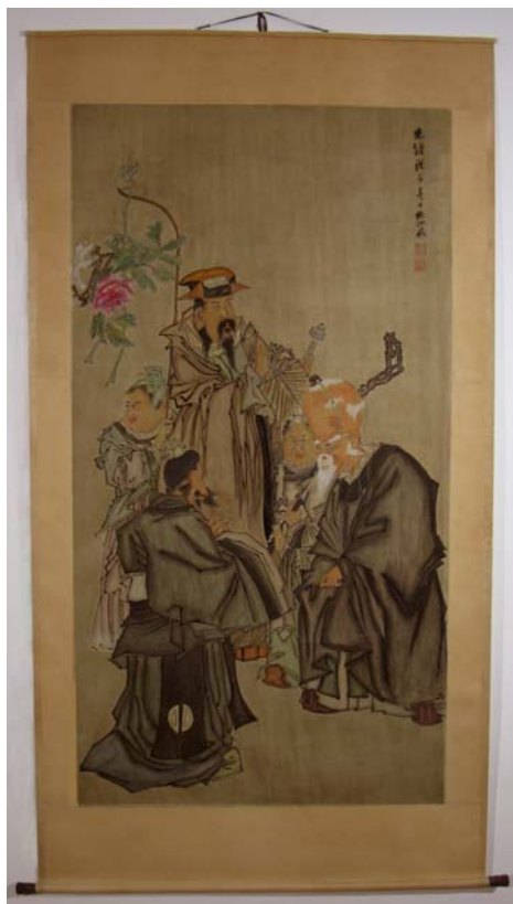
Ill. 3. "Three Gods of Good Fortune", 19th c., Asia and Pacific Museum in Warsaw, inv. no: MAiP 15814. Condition after the conservation treatment