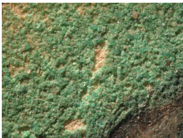
Ill. 16. "Landscape with architecture", 19th c., Asia and Pacific Museum in Warsaw, inv. no: MAiP 5394. Microscopic magnification of the layer of malachite showing the poor adhesion and the loose parts of the pigment