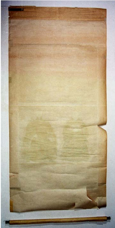
Ill. 20. "The Portraits of the Ancestors", 19th/20th c., private collection in Warsaw. The back side of the scroll showing the "shadows" in the parts painted with azurite and malachite