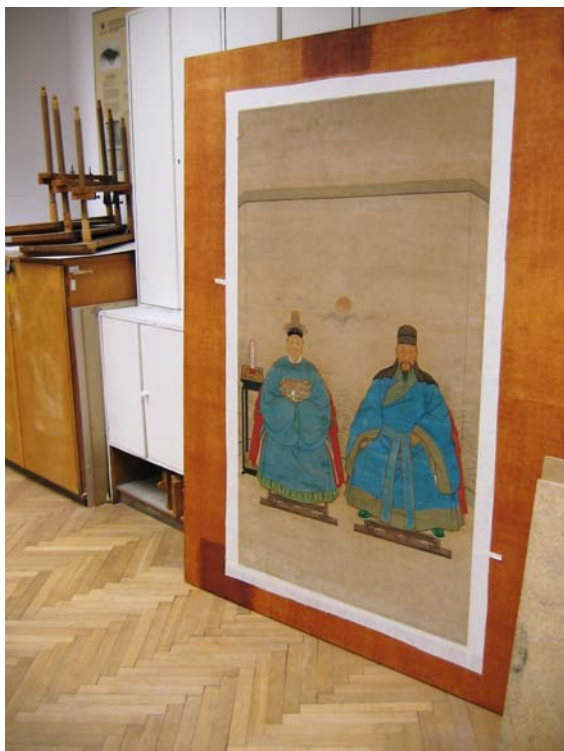
Ill. 21. "The Portraits of the Ancestors", 19th/20th c., private collection in Warsaw. The painting during the conservation treatment, stretched on the drying board after the procedure of lining