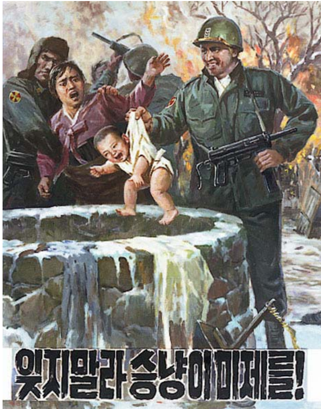
(Ill. 7) "Do not forget, the evil American Empire!"; hand painted poster