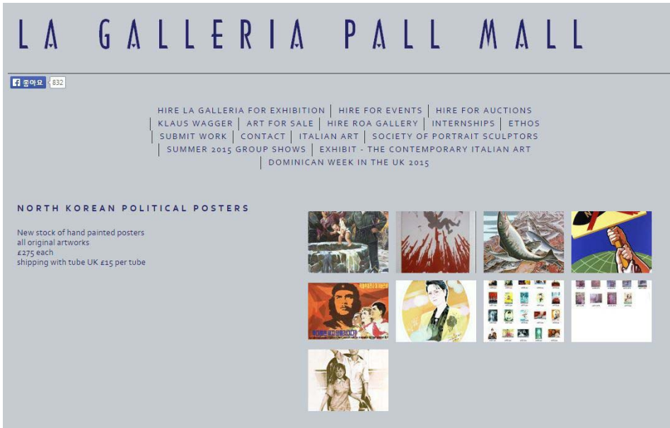
(III. 5) Website of La Galleria Pall Mall, North Korean Political Posters are still sold via the website