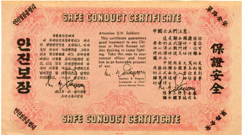
(Ill. 3) Korean War, 1953, Safe Conduct Certificate. It guarantees good treatment to any Chinese or North Korean soldiers desiring to cease fighting