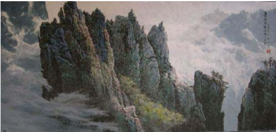
(III. 6) Fantastic Rock of Chonsoda Mt Kungham, Son U Yong, Ink on Paper