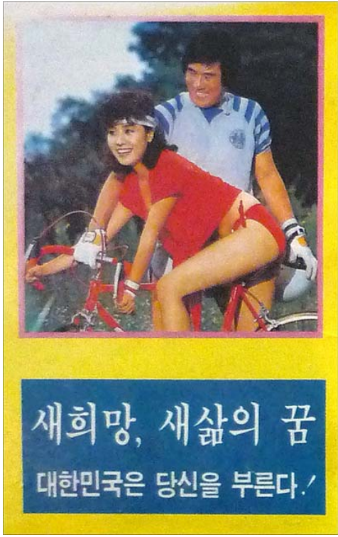
(Ill. 4) "New hope, the dream of new life, South Korea is calling you!" This paper bomb distributed in the air of North Korea shows the economic development and better life quality of South Korea