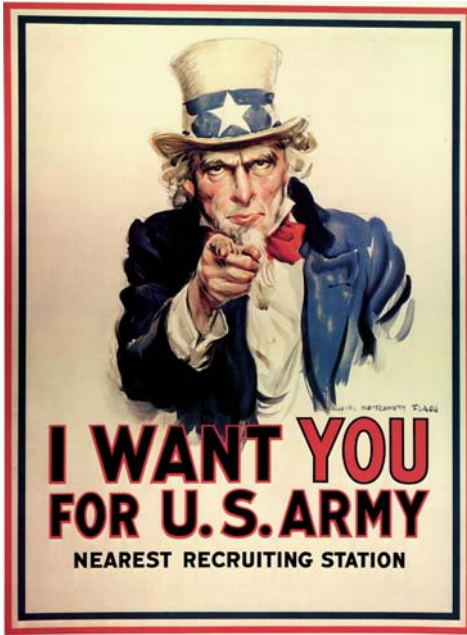
(Ill. 1) American recruiting poster from World War I depicting Uncle Sam, the personification of the United States. https://en.wikipedia.org/wiki/Uncle_Sam