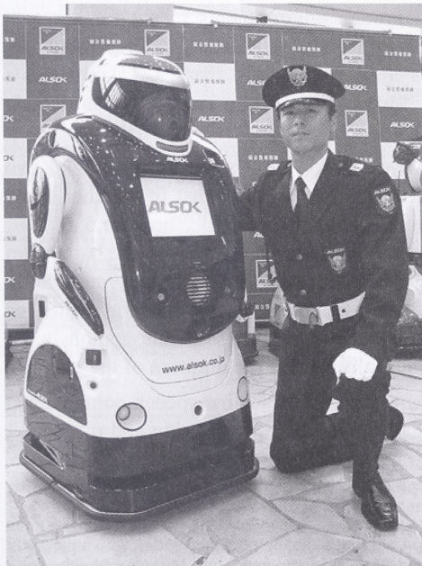
Figures 2a and 2b: Left: Alsok's Guard Robot D1; right: Flower Robotics' Posy.