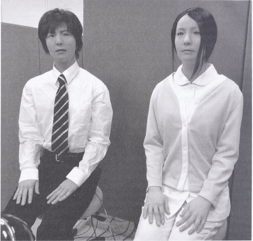
Figure 3: Geminoid-F and her cross-dressed version, Kurokawa-kun (screenshot)

her hairstyle and clothing, and by lowering her voice, they created Kurokawa-kun, a robot otokoyaku .