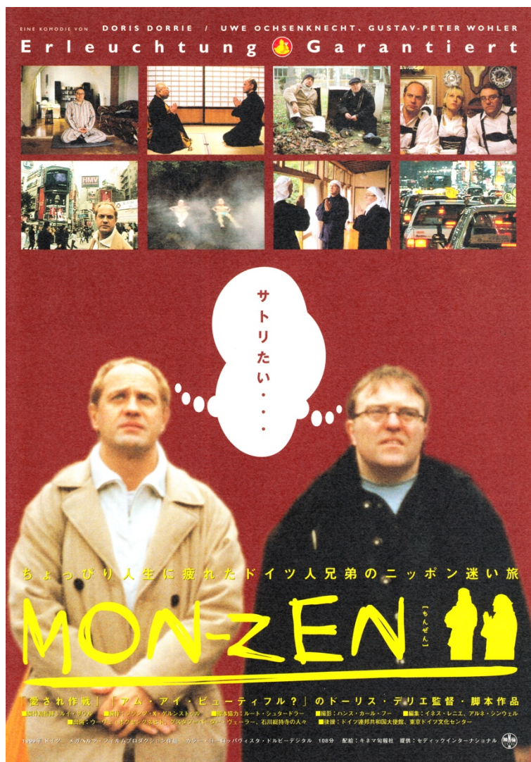
Fig. 4 Film poster for Enlightenment Guaranteed for release in Japan in 2002. The thought bubble appears in the simple Katakana and Hiragana characters instead of Kanji: サトリたい... ( satoritai , Engl. "I wish enlightenment"; satori or 悟り meaning enlightenment).