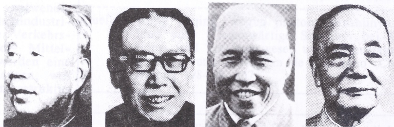
Wan Li Wu Xueqian Yang Rudai Yang Shangkun