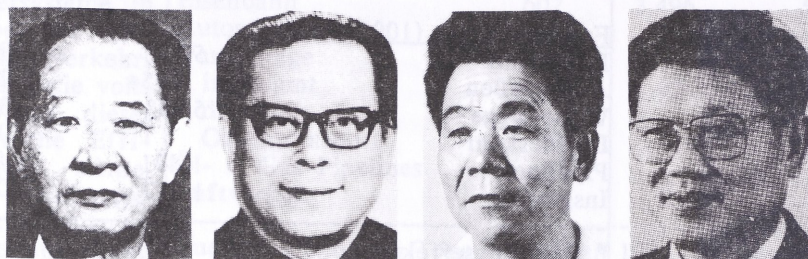
Hu Yaobang Jiang Zemin Li Ruihuan Li Tieying