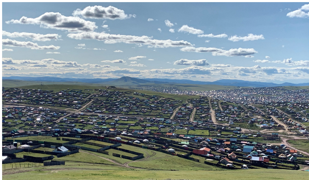
Figure 2: A ger district in the south of Erdenet (Ganchimeg Altangerel, August 2019)

As people had previously been organised in collectives their labour was specified. Privatisation from 1992 entailed that a single owner had to be capable of managing an entire herd. In combination with natural catastrophes many herders lost all their livestock and had to move to urban areas. This mobility affected the whole country. From west to east, people moved to the industrial regions in the centre or northern parts of Mongolia, and especially to Ulaanbaatar in search of better opportunities in education and services related to health care. Herders whose livestock had died from cold and natural catastrophes 20 had to move to Ulaanbaatar, Erdenet or Darkhan without any financial security.