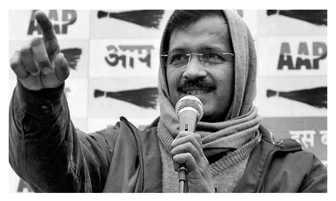
Figure 3: Kejriwal in his trademark muffler Source: http://www.hindustantimes.com (for link details see list of references)

conferred upon him that unmistakeable ordinariness. The muffler was the most visible (because of its oddity) badge of simplicity and nearly phallic in its significance because Kejriwal's public persona was almost centred around the muffler, which in turn produced all those associations Kejriwal would be known for. Though a muffler is commonly used by people during winter, including the upwardly mobile, Kejriwal's style of pulling it over the head to cover the ears before making a knot around the neck made him appear distinctly ordinary (see Figure 3).