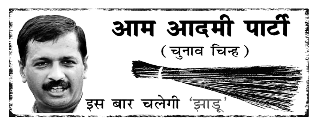
Figure 2: Aam Aadmi Party's election symbol

However holier-than-thou the above lines may seem, the political goal was to co-opt the voice of a large chunk of class-based voters who usually vote for the communist parties (and also the Congress Party), as well as caste-based voters who saw in the broom and the motto "dignity of labour", a possibility for their inclusion and a transcendence of the stigma associated with cleaning, sweeping and scavenging. Much more than BSP's elephant, the Samajwadi Party's cycle, RJD's lantern or the hammer and sickle of the Communist Party of India (Marxist) [CPI(M)], the broom was symbolic of a political experiment from below. Investing the broom symbol with political significance transformed it from a cleaning tool or even a metaphor of low social status into a potent vehicle for social and political transformation (see Figure 2).