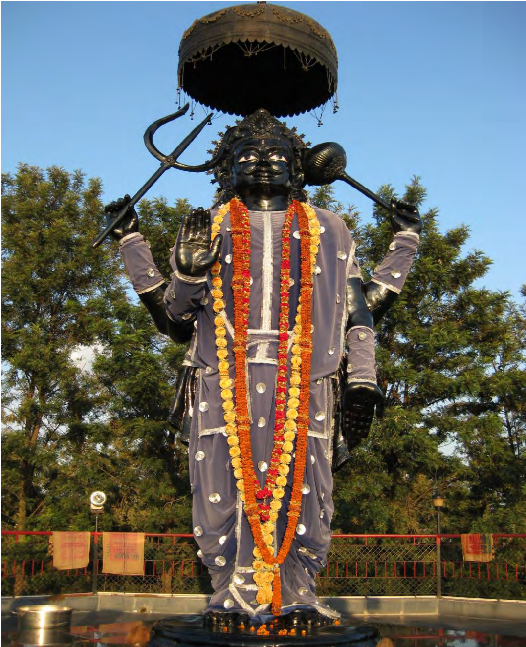
Fig 5: Śani mūrti , Śani Dhām.

According to temple patrons, mustard oil is offered to Śani not only because he likes it, but because he needs it. Specifically, they cite versions of popular stories that relate how Hanuman – accidentally, on purpose, or accidentally-on-purpose – beat Śani and then, to add insult to injury, refused Śani the mustard oil he requested to dress his wounds (Lutgendorf 2007: 175-76; 233-234; 140-142; 200; 202). Hence, the mustard oil that