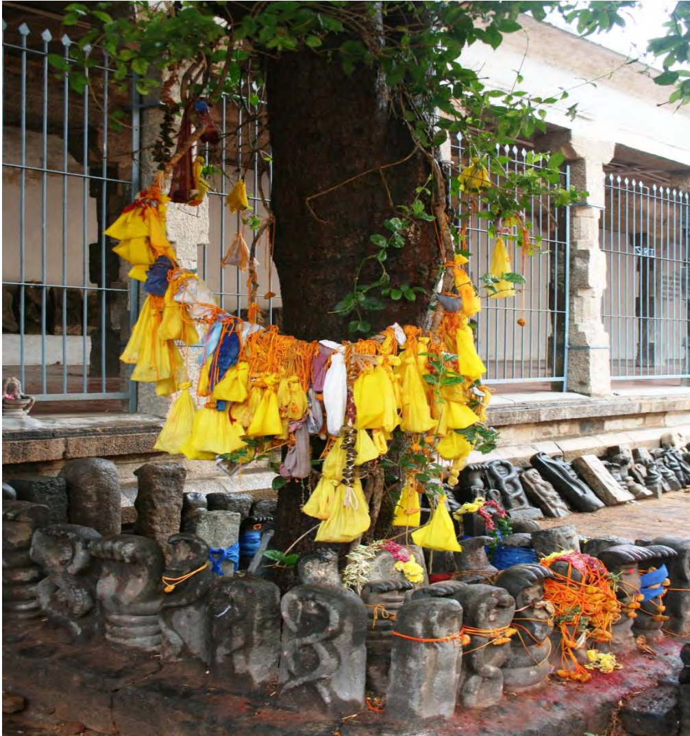
Fig 3: Stone snake sculptures underneath a sacred tree in the courtyard of the temple dedicated to Rāhu in Thirunageshwaram, Tamil Nadu.

Scholars working in other contexts have also noted instances where the Kali Yuga was invoked in connection with the less-than-ideal conditions of contemporary life; although nāga dōṣam does not surface in their work, these scholars' findings corroborate the concerns about environmental degradation, changing gender roles, the care of the elderly, and waning ritual observance that I heard expressed in South India. Ann Grodzins Gold reports on perceptions about environmental and social change from the opposite corner of the subcontinent, where Rajasthani villagers linked deforestation and decreasing rainfall with a decline in dharma and morality (1988). Many of her interlocutors associated the Kali Yuga with alterations in human character, relationships, and interactions with the natural environment and viewed agricultural advancements not as improvements or