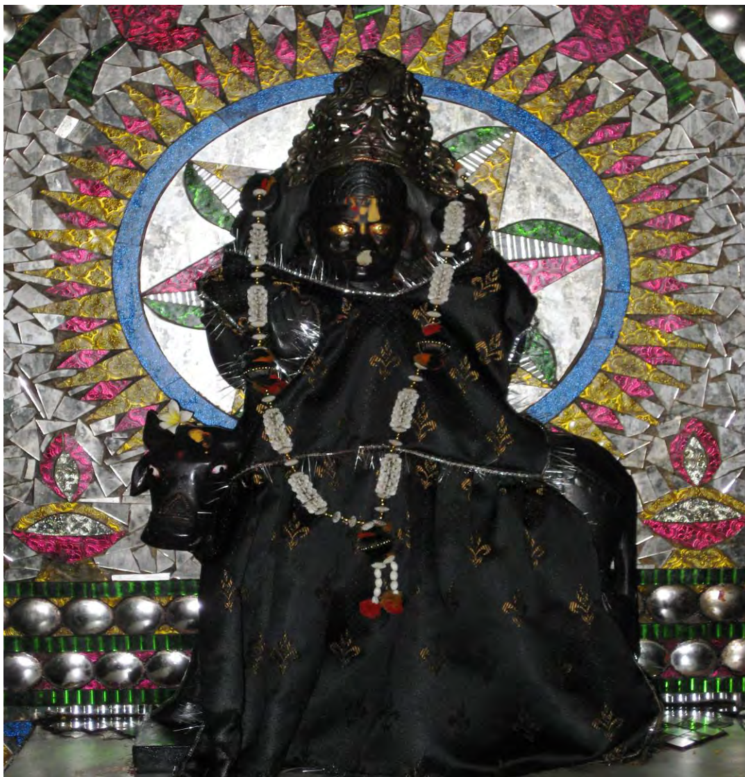
Fig 1: Śani mūrti, ḍakaut -administered Śani temple, Paharganj, Delhi.

Ḍakauts are also astrologers, and their right to practice this profession is clearly articulated in their origin story. Thus, in the process of explaining their professional credentials to me, a Paharganj-based ḍakaut couple affiliated with what is may be the oldest Śani temple in Old Delhi moved from a discussion of their unique ability to digest Śani dān (offerings made to Śani) to a description of their lineage and the origin of their profession as astrologers. 6 As the wife explained: