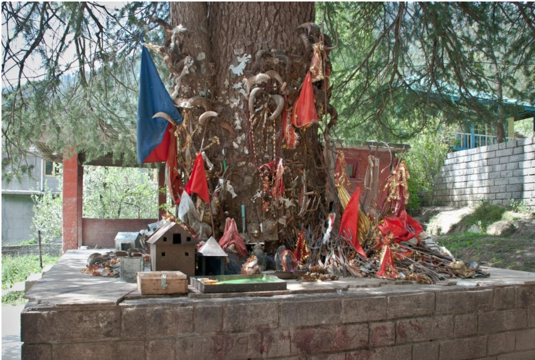
Fig 4: Ghaṭotkaca's tree shrine.

Haḍimbā's demonic character is thus celebrated for its unique ability to instantly produce a powerful warrior who was urgently needed by the Pāṇḍavas in their battle against the Kauravas. Her rākṣasī nature was not a liability, but rather Haḍimbā's unique advantage and what enabled her indispensable contribution to the military effort.