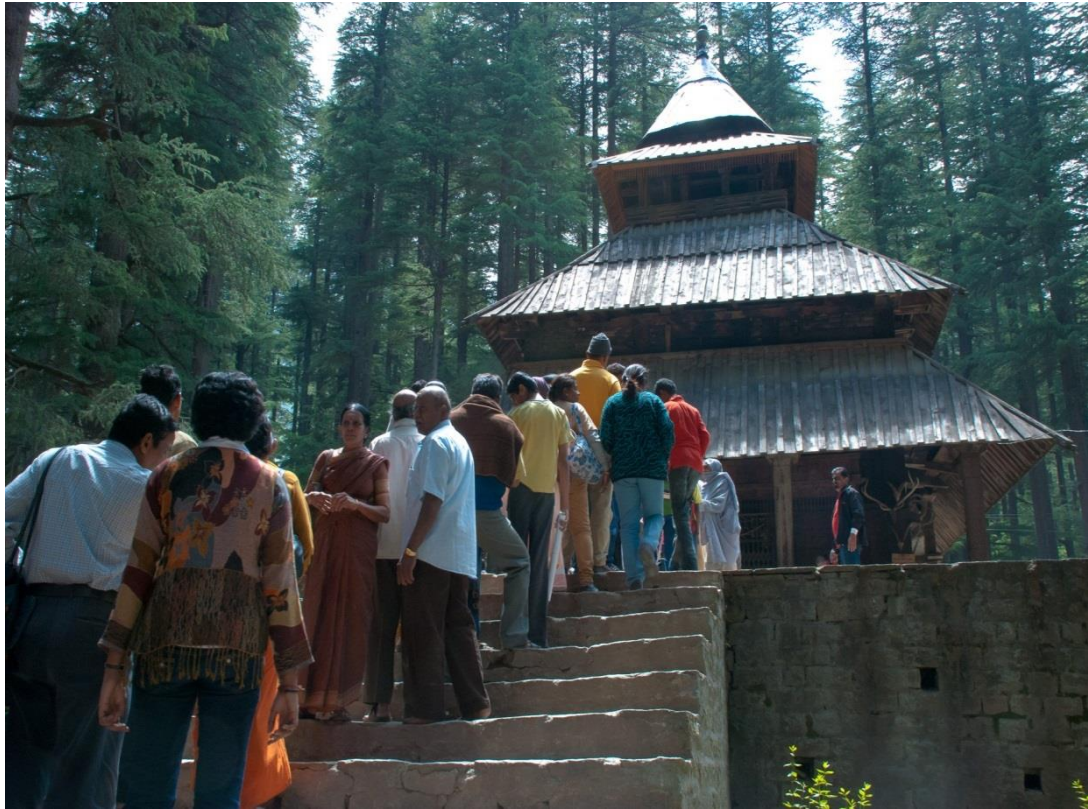
Fig 3: Tourists waiting in line in front of the Haḍimbā temple.

The rest of the poem describes Bhim's killing Haḍimb with the help of Haḍimbā, the birth and death of Ghaṭotkaca, the crowning by Haḍimbā of the founding father of the local ruling dynasty, and the goddess's important ritual role in the annual Daśahrā festival. The significant point here is the complete identification of Haḍimbā with the goddess Kālī. The former is portrayed as an incarnation of the latter, born on earth in order to save the seers and sages, and humanity at large, from the evil tyrant Haḍimb.