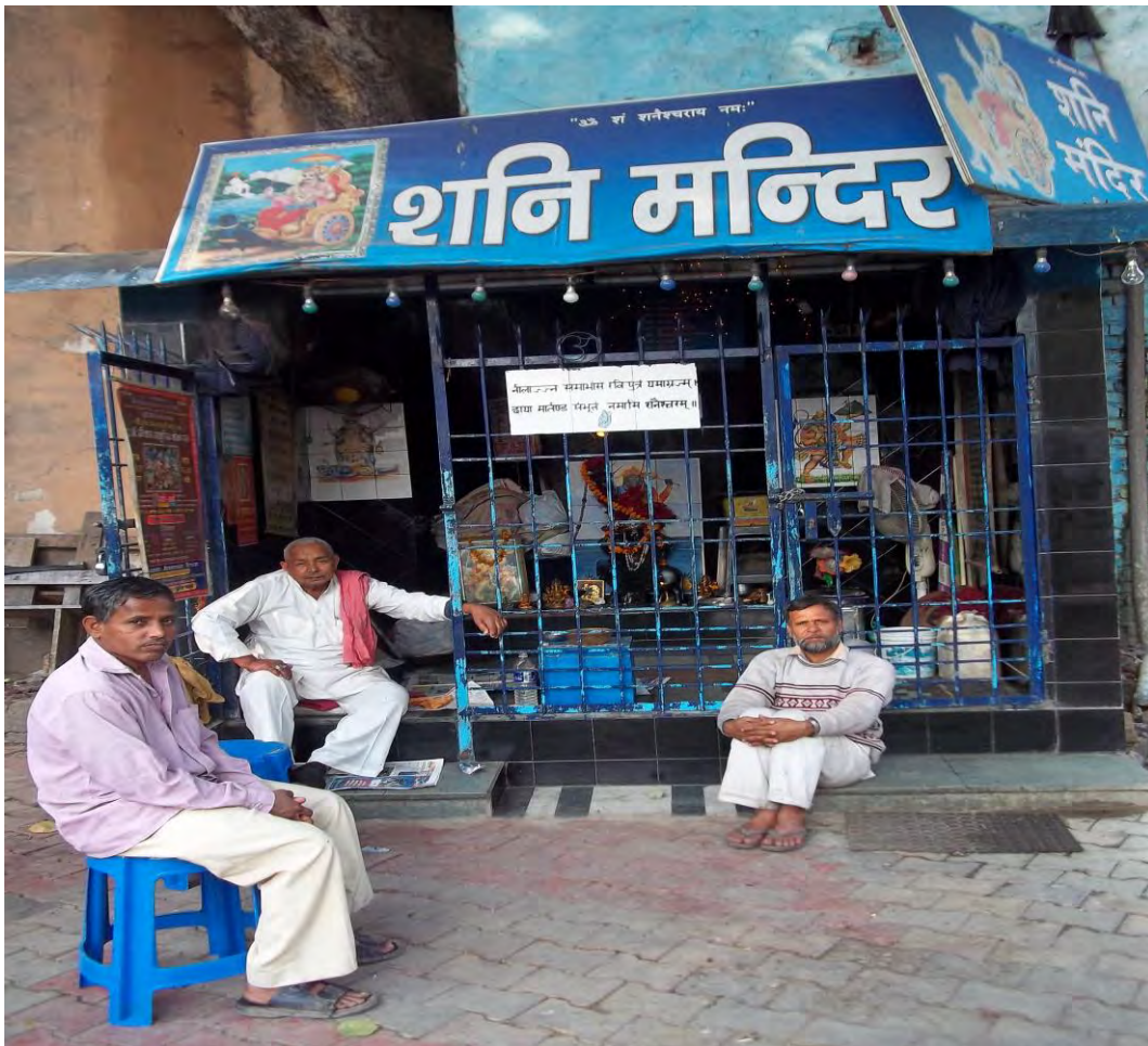
Fig 4: Śani temple, Paharganj Metro station, Delhi.

The geography of this temple, with its massive central image of Śani – not to mention its scene on Saturday – strongly suggests that this fine distinction between Śani prasād and Nine Planets prasād may be lost on at least some of the thousands who visit on Saturdays; further, the Saturday prasād that is offered at this Nine Planets temple is a chick pea-based concoction that looks and tastes exactly like the prasād offered at a small ḍakaut -administered Śani temple near the Paharganj Metro station.