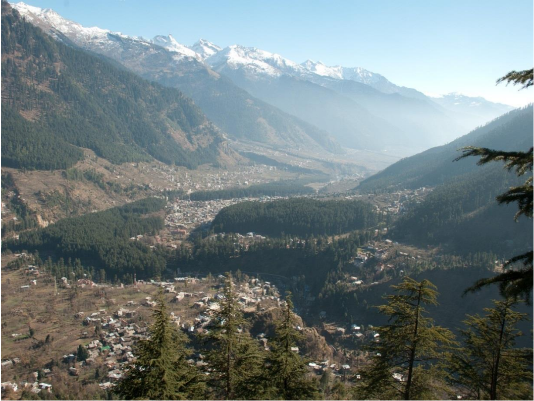
Fig 1: Kullu Valley, Himachal Pradesh: A view from above.

The Hindu image of time, portrayed in the Purāṇas and other classical texts, is based on the notion that the universe undergoes repeated and endless cycles of creation and destruction. Each cycle is comprised of four ages ( yugās ), which advance from one to the next in an ongoing process of successive degradation. According to this view, the universe begins with the age of creation, the perfect Ṛtayug (also known as the Satyug , the age of truth), proceeds through the Tretāyug and the Dvāparayug , and arrives at the Kaliyug , the last and most horrible eon in the cycle. The Kaliyug is named after the worst possible throw in the ancient Indian game of dice, which was later personified as the male demigod Kali , believed to preside over this decadent age. The latter should not to be confused with the goddess Kālī , whose name is pronounced and spelled with long vowels. The Kaliyug is considered a time of moral degradation, deceit, greed and selfishness, sexual promiscuity, and total collapse of governance, social order, and even climatic and environmental imbalance. 2