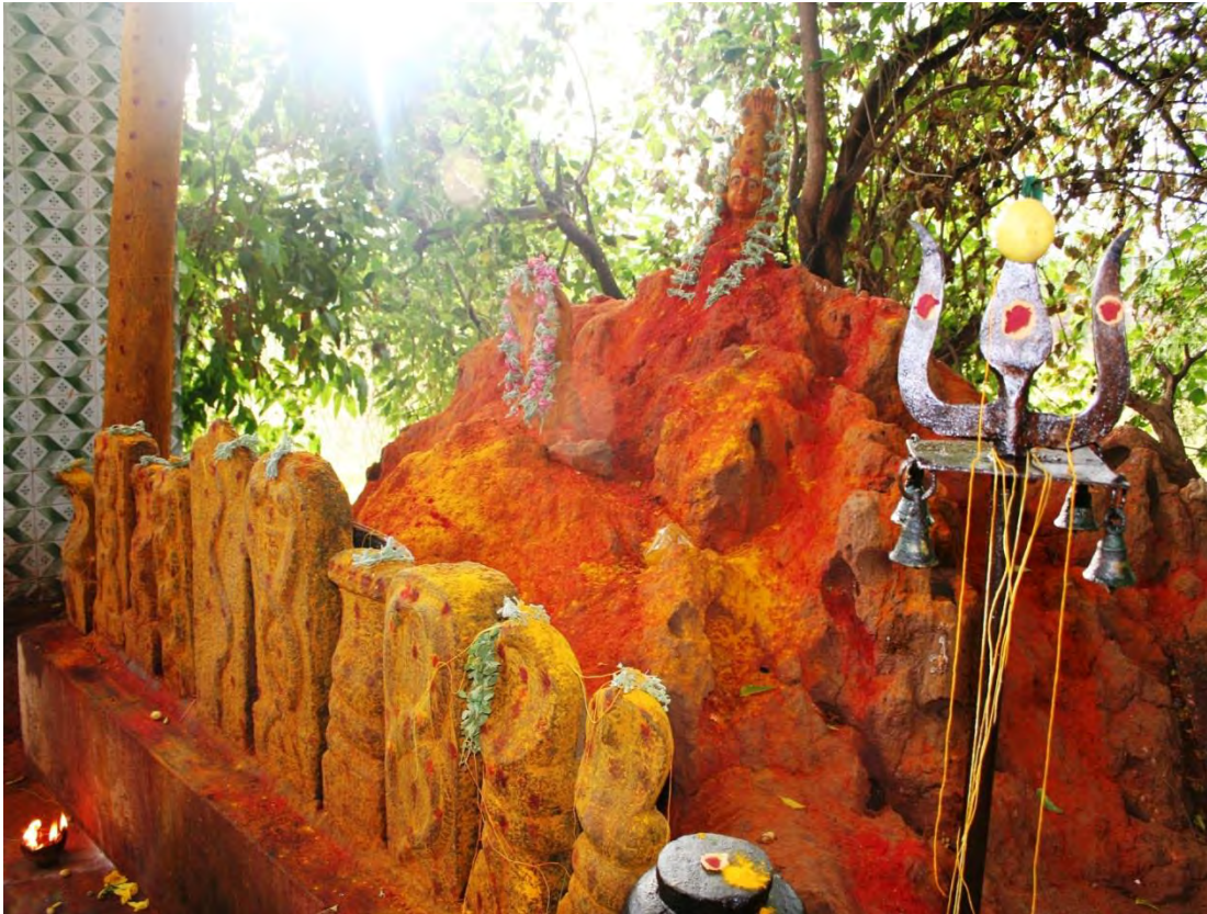
Fig 2: At this open-air shrine the Goddess is represented anthropomorphically and in her anthill form, as well as by the decorated trident to the right. A row of stone snake sculptures borders the anthill, wherein the snake goddess is believed to live in her form as a divine reptile. Turmeric and vermillion powders as well as flower garlands indicate devotional activity, as does the oil lamp that has been placed on the ground at the left.

believed to reside. Those who are initially unsuccessful in their bids to ameliorate dōṣam 's negative effects may progress to more elaborate and costly ritual interventions, such as retaining a priest to install a stone snake sculpture and establish divine life in it ( nāga pratiṣṭhā ), gifting a silver or gold nāga image to a Brahmin priest, and/or making a pilgrimage to one of the regionally important temples associated with this astrological defect.