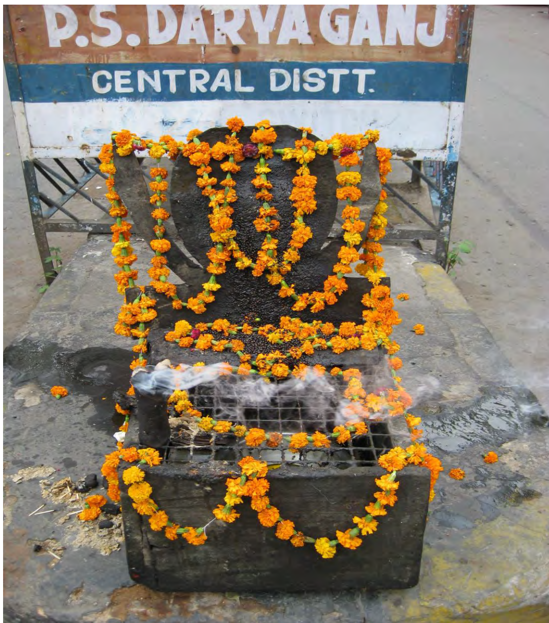
Fig 2: Ḍakaut -owned portable Śani shrine.

In addition to serving as pujārī and astrologers, Ḍakauts in Delhi make a living by maintaining Śani street shrines. In their most basic form, these shrines consist of a small iron image of Śani presiding over a receptacle filled with mustard oil, an offering known to please him. Passersby drop coins in them, and these offerings quickly sink below the oil, where they are collected at the end of the day by the shrine's owner . In Old Delhi, many of these portable Śani shrines are under the jurisdiction of one extended family of Ḍakauts – five brothers who say that their family lived in Old Delhi long before Partition changed the geography of the city. Their shrines are