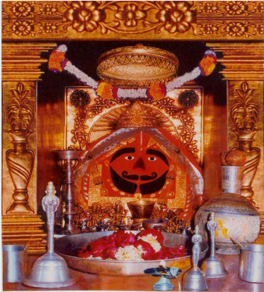
Figure 1. Bālājī, Sālāsar Temple. Photograph provided by a Brāhmaṇ from the temple. Published with permission.

pilgrimage here, so it is not simply a story of miracles. In explaining the god's rising fame, devotees cited improved roads and the availability of transportation, the promotion of Bālājī on religious-themed television channels, increased wealth for leisure activities, and, as mentioned earlier, a general rise in devotion to Hanumān.