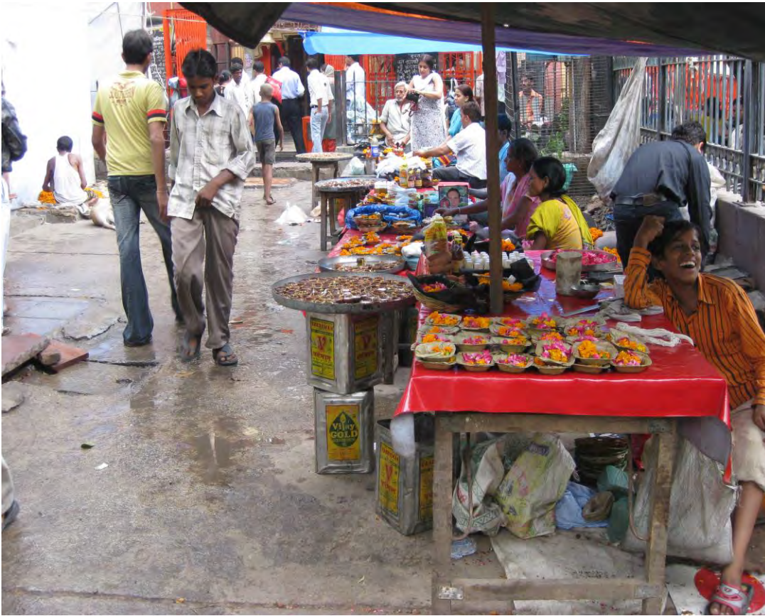
Fig 3: Saturday at the Chandni Chauk Nine Planets temple.

Interestingly, the Brahmin management at this temple takes a conventional and historically “accurate” view that no one but a ḍakaut can or should consume things that have been offered to Śanidev because no one but a ḍakaut can bear Śani’s dangerous, inauspicious influence. In this case, a donor wanted to contribute a Śani mūrti to the temple in an effort to mitigate the effect of his sāḥe sātī . However, he was initially unable to find a temple willing to accept his donation. As the temple management explained to me: