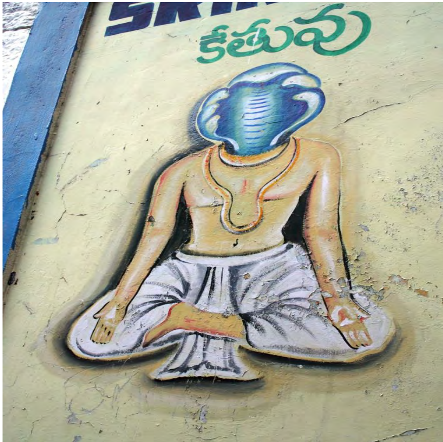
A painting of Ketu in a hybrid, anthropomorphic-theriomorphic, form on a wall at the Kalahasti temple in Andhra Pradesh. This image is accompanied by a menu of remedial rituals ( parikārams), along with their respective prices, that are on offer to counter dōṣam.