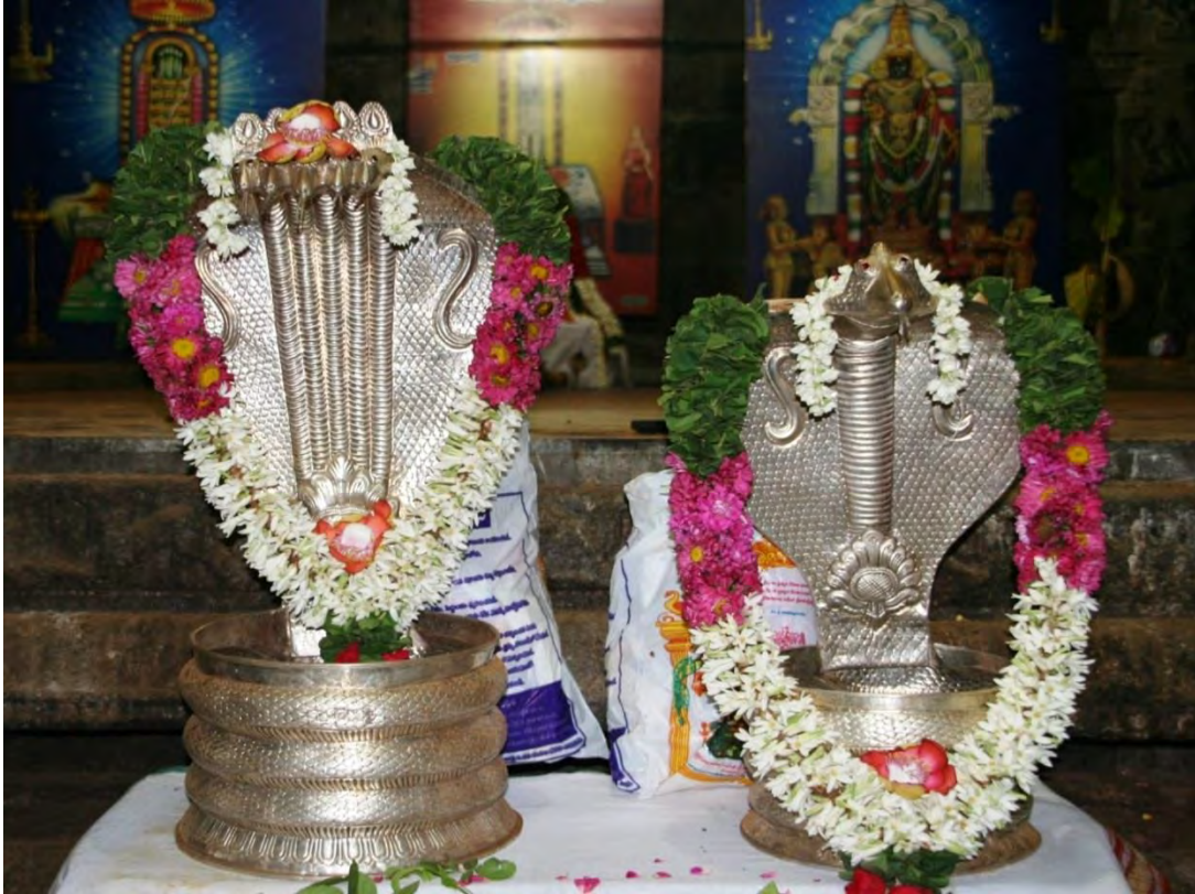
Fig 1: Silver images of Rāhu (on the right) and Ketu (on the left) on display at the temple in Kalahasti, Andhra Pradesh.

Here Visveshwaran counts nāga dōṣam , or “snake blemish,” as one among the negative planetary influences that predominate in the kaliyugam (the Kali Yuga), the final and most degraded among the four Hindu world ages. 5 This astrological flaw is believed to be produced when the shadow planets ( chāyā graha ) Rāhu and Ketu (Ta. Kētu ) – which are, respectively, the north and south lunar nodes, where the moon’s and the sun’s paths cross in the sky – occupy inauspicious positions in an individual’s horoscope ( jātakam ). While nāga dōṣam is commonly understood to result from having killed or harmed a snake in this or a previous life, Visveshwaran also identifies it as an affliction that is uniquely indexed to these troubling, Kali Yuga times and claims that selfish and insincere people effectively invite on themselves.